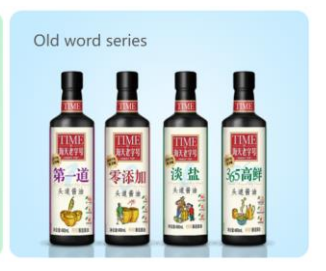
Foshan Haitian soy sauces encompassing several product range

1: McKinsey & Company, "Global growth, local roots: The shift toward emerging markets," August 2017 Stock shown for illustrative purposes only and should not be considered as advice or a recommendation