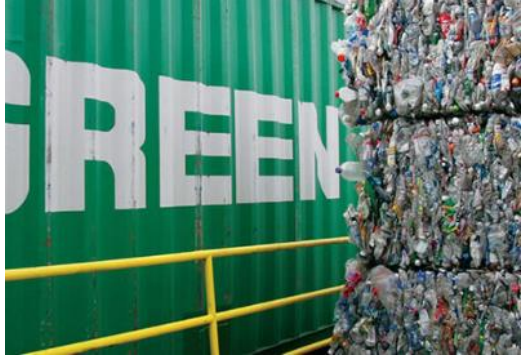
Waste Connections recycling process

1: BoFAM – Taking out the Trash – Global Waste Primer, June 2018.