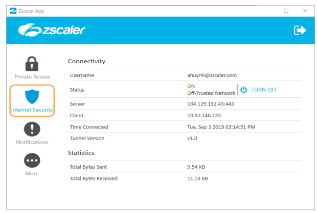
Internet Security with Zscaler App

Zscaler provides a cloud-based platform encompassing several security services (web security, firewalls, sandboxing, antivirus) which allow businesses to create fast, secure connections between users and applications, regardless of device, location, or network. Performance and security on the cloud are key concerns for work-from-home setups, and Zscaler has seen an acceleration in cloud security deployments to address those needs.