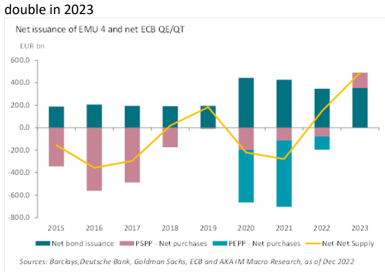
Exhibit 3 – "Net net" supply of European government bonds to

Note that even such prudent approach would not be riskless. Between 2015 and 2021, "net net" supply of government bonds (net issuance minus ECB purchases via its various Quantitative Easing (QE) programmes) was – briefly and marginally – positive only in 2018/2019. In 2020 and 2021, massive purchases brought net net supply into deeply negative territory again, despite massive issuance by governments funding the mitigation of the pandemic. Supply turned positive again in 2022, and on the basis of the forecasts from sell-side houses and using our own expectations for ECB reinvestment, it would more than double in 2023 to nearly EUR500bn. It is a significant change, and one of the reasons why we remain circumspect on the idea that long-term interest rates have reached their peak in the Euro area. On the US market, investors know what the Fed intends to do, and it's probably already largely priced in. The same does not hold in the Euro area.